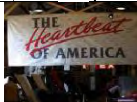
VIC: Louis Rokas (photo coming)